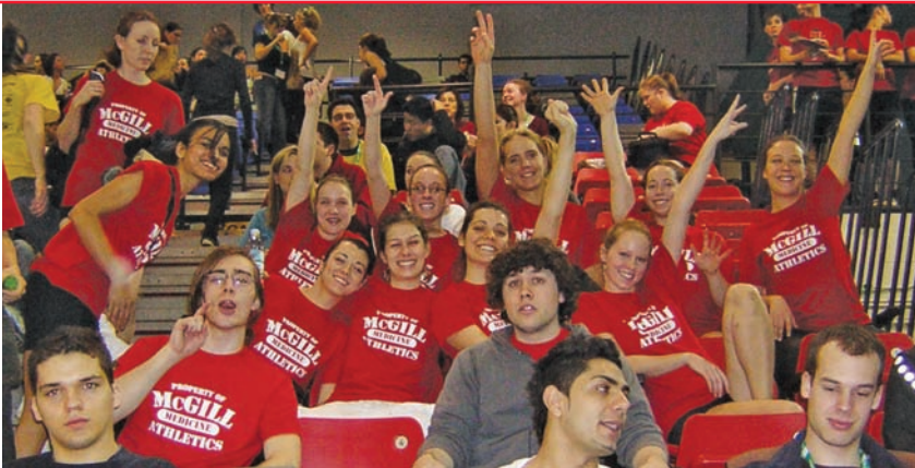
Medical students from across Canada enjoying Medgames 2007, held at McGill.