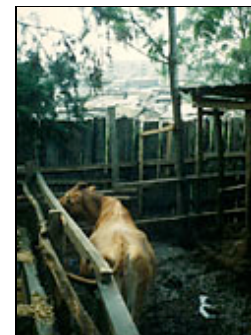
A cow at the back of a home in Nairobi, Kenya

The challenge is to view lettuce and chard on equal footing with bricks and mortar. Urban planners and architects first think of housing, parking and commercial development when they design cities, but they should consider the benefits — social, visual and physical — of