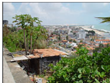
Fruit-bearing tree planting in a barrio in Natal, Brazil (cashew bush in front, papaya tree in back)