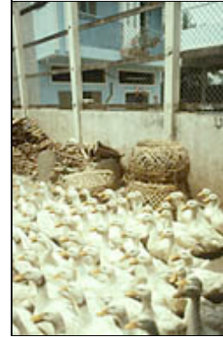
Duck farming in an urban setting