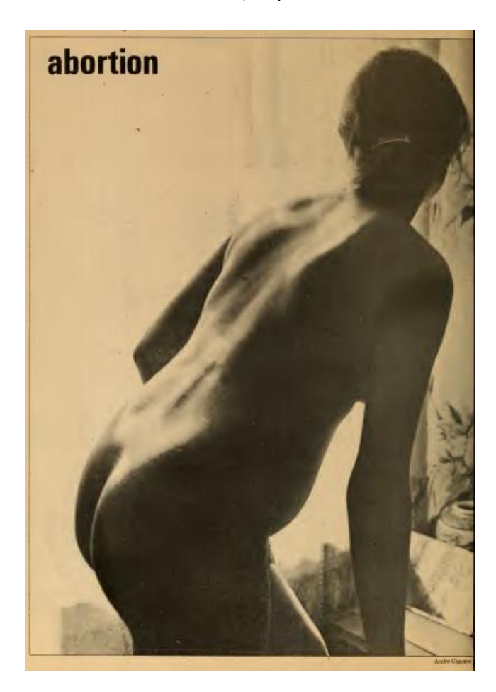
Figure 3. From the 2nd edition of The Birth Control Handbook, 1969.

a specific section titled The IUD and genocide . It stated the intrauterine devices were being used as an inexpensive and convenient tool to control the reproduction of non-white people. The section ended with the statement "large scale use of contraceptive measures, applied to women who may not want to control their fertility, approaches genocide and ceases to be birth control" ("The Birth Control Handbook" 4th ed., 21).