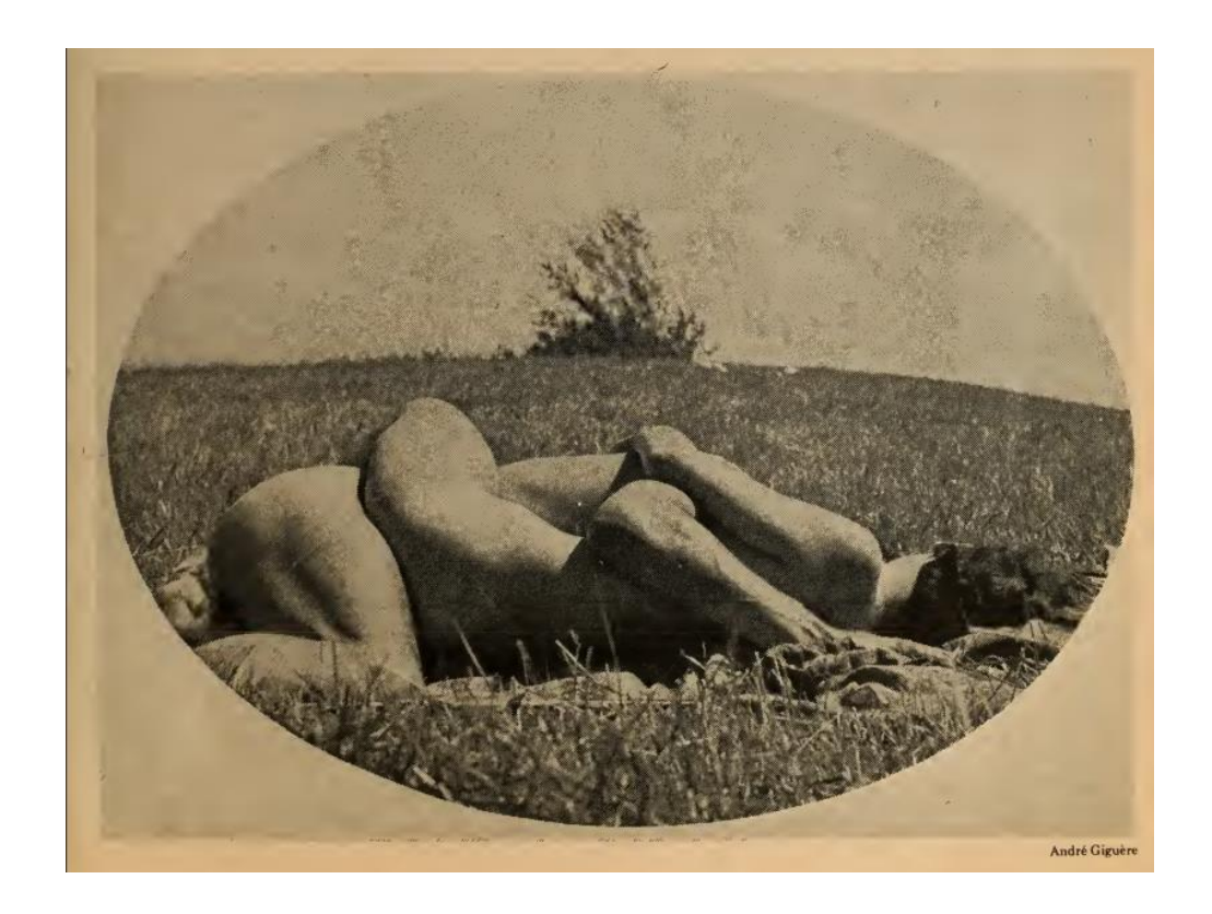
Figure 2. From the 2nd edition of The Birth Control Handbook, 1969.