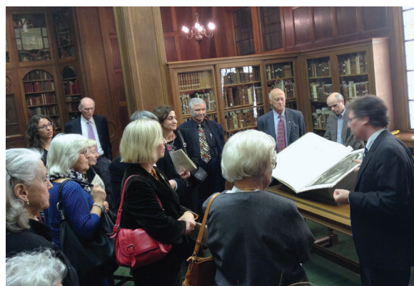
Friends of the Library Annual General Meeting 2012 Osler Library of the History of Medicine

The Rare Books and Special Collections are one of the Library's marks of distinction, offering an extraordinary range of materials, from rare books and historical documents to architectural drawings, musical scores and political and Olympic memorabilia.