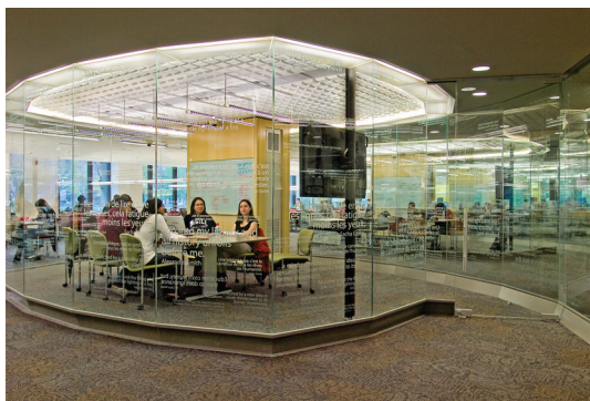
Cyberthèque pod, Humanities & Social Sciences Library

Founded some 25 years ago, the Friends of the Library is a not-for-profit, volunteer organization advocating for the McGill University Library. Our mission is to nurture community interest in the Library, building awareness of its rich resources and cultivating long-term support for its collections. Our members are McGill alumni, students, staff and faculty, as well as Library and McGill enthusiasts from around North America. We invite you to become a Friend of McGill's great Library. Your membership will help a renowned public lecture series, as well as acquisitions to enrich the Library's collection. Your support continues to make this Library a top-ranked institution.