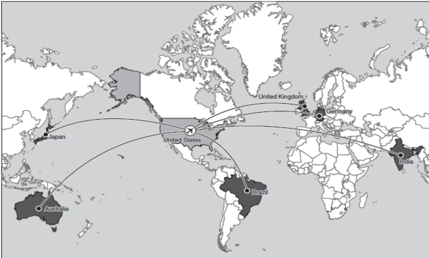
Figure 2: Nonborder Countries Children Were Abducted to Most, Fiscal Years 2007-2009