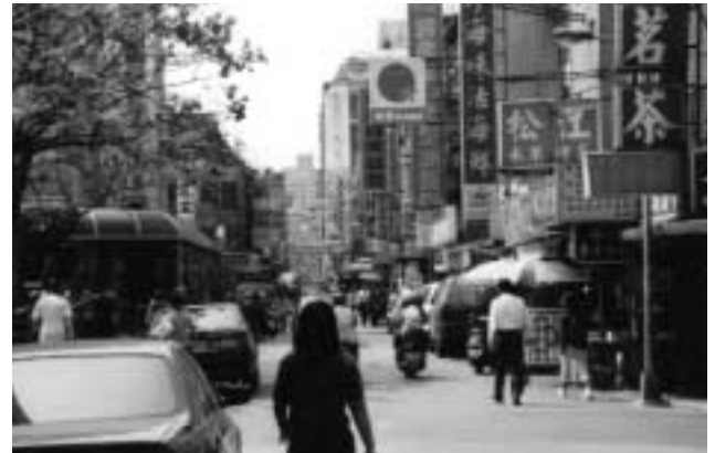
Taiwan city street