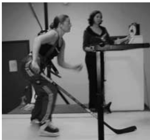
Graduate students working on the skating treadmill (the simulated ice rink).