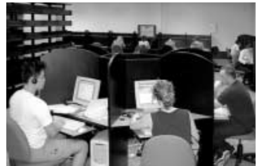
Library computer lab

Thanks to the most generous support of our undergraduate student body, the SSMU Library Improvement Fund for 2000/2001 has provided for nineteen new library work stations, and nine state-of-the-art computers in the new room annexed to the