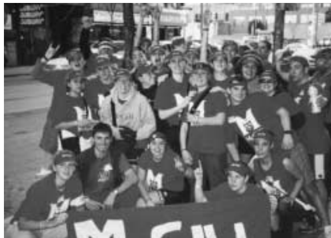
2001 participants in this year's Kin-Games in Laval.