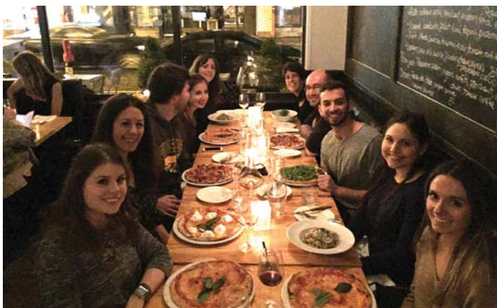
DAIR Team at Dinner Together

The DAIR research team is comprised of 12 graduate students from a variety of Master's and PhD programs in the Department of Educational and Counselling Psychology. The team is also comprised of 30 committed research volunteers and research assistants, who play an integral role in the many research-related tasks such as project coordination, data collection and data entry.