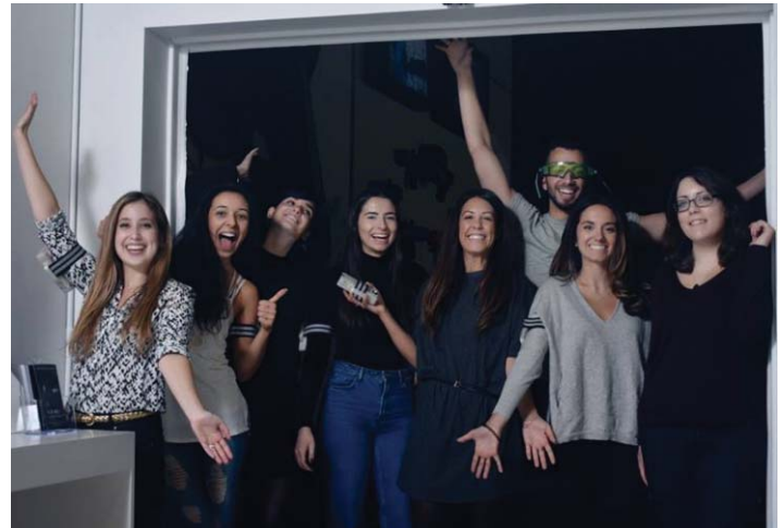
DAIR Team Social Activity at Amaze Escape Room

Research project meetings, as well as publication group meetings in which conference presentations and journal publications are reviewed and discussed are regular occurrences for the DAIR Research Team. With over 11 published peer-reviewed articles and 33 conference presentations in the last year alone, these meetings are essential to the team's scholarly productivity. In addition, the team has regular social events including lunch or drinks at Thomson House to Escape Room activities.