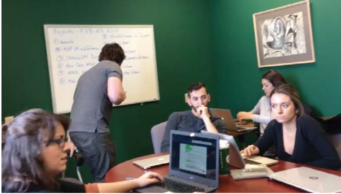
DAIR research Team Meeting

employees in the mental health commission, and many others from across the country gathered over two days to discuss the status of teacher and school staff well-being in national and provincial/territory-specific contexts.