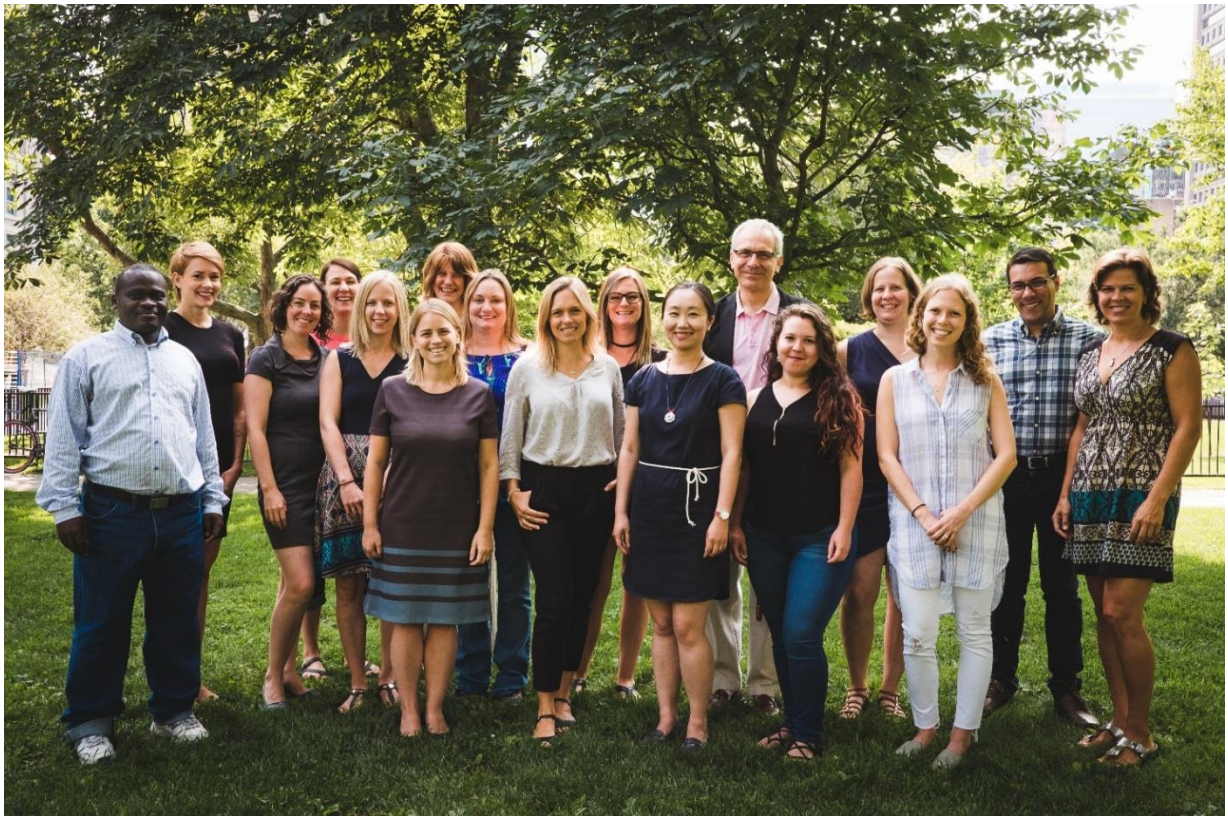
2016 CRCF Team Photo

The CRCF brings together a thriving academic community with 29 faculty members, 14 associate members, 4 postdoctoral fellows, as well as 41 students involved in Centre activities as research assistants and trainees, participating in research seminars, journal clubs and research methods workshops. The Centre can also count on outstanding staff members that bring invaluable support to the Centre's activities.