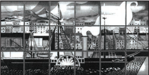
McGill Metro Station La vie à Montréal au XIXe siècle Stained-glass mural by Nicolas Sollogoub