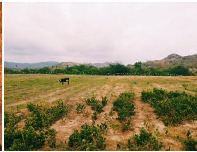
Greenland Livestock Research Facility