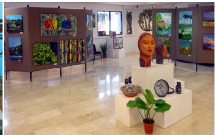
Medford Mahogany Craft Village