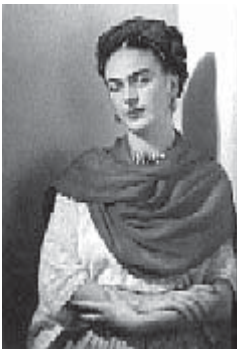
Photo of Frida Kahlo

Every year we have the pleasure of a fine art work to lend its beauty to the Annual McGill Pain Day poster. This year's choice for the 8th Annual McGill Pain Day poster was Frida Kahlo's "The Broken Column", an interesting, and perhaps appropriate choice to represent this department's work in the treatment and study of pain, considering the obstacles pain sufferers face on a day-to-day basis.