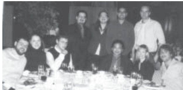
Anesthesia Residents and Guests