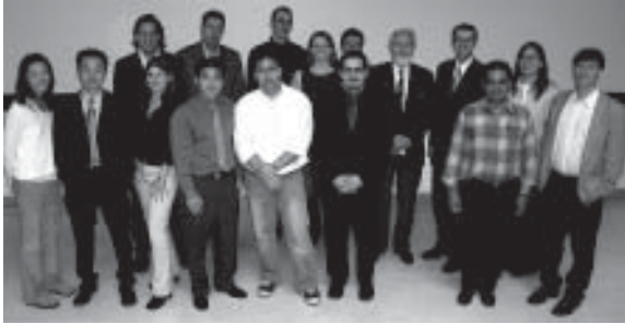
Bromage Day Participants