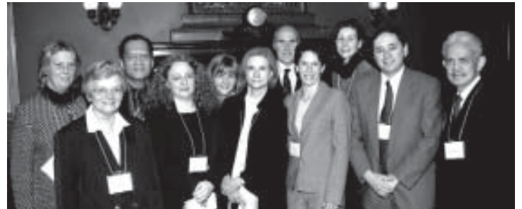
MCH Staff & Faculty in Attendance

The function was well attended by members and friends of the Department, former employees of the QEH, members of the Board of the QEH Foundation and donors. We should be proud as this event represents a milestone in the history of our Department and recognizes the importance of the pediatric anesthesia academic mission. The newly formed chair complements the other two endowed chairs, the Wesley Bourne and the Harold Griffith, established in the 1980's.